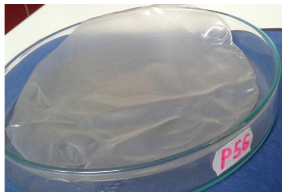
Figure 2. Examples of polymers biosynthesized from Ps. Putida and B. Subtilis containing the PHO / PHA between 85.83-86.8%

A PHO film obtained in conditions above mentioned is showed in Fig. 2.